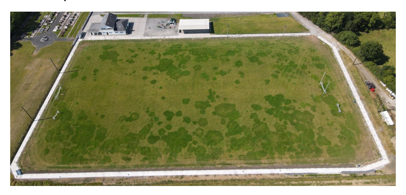
Pitch spiking completed on 24<sup>th</sup> May to reduce compaction on the pitch

At the moment, the club's priority is to finish the walkway works and then turn our attention to pitch care thereafter.